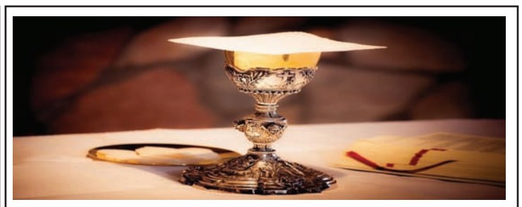
Masses for WEEK SEPTEMBER 10-16, 2022

Nulla é più caro a Dio della misericordia. Egli non respinge ma attira, non forza ma attende. Trepida per chi si perde e accoglie con gioia chi ritorna. Sorprende e affascina chi si converte. La misericordia di Dio raggiunge il peccatore per vie dirverse, talora inimmaginabili, come traspare dalle letture liturgiche di questa domenica. Dio si lascia intenerire dalla supplica umile e risoluta di Mosè a favore del popolo eletto, duro di mente e di cuore, che lo ha rinnegato con l'idolataria. San Paolo, conquistato da Cristo, rilegge con grato stupore la sua esperienza passata. Egli è apostolo per la misericordia ricevuta; non esita a dichiararsi il capofila dei peccatori salvati da Cristo ed è fiero d'aver beneficiato per primo del suo immenso amore. Sulle parole dell'Apostolo s'innestano, come in dissolvenza, le parabole della misericordia, nelle quali il binomio "perduto-ritrovato", attinente al peccatore pentito, dice la laboriosa premura divina e l'attesa paziente, colma di speranza. La misericordia è il dono e lo stile permanente di Dio. C'è chi non lo comprende per grettezza d'animo, ma nel cuore del Padre c'è posto anche per lui.