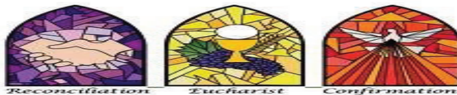
Reconciliation Eucharist Confirmation

SHARELIFE – LIVING THE GOSPEL 50 TH ANNIVERSARY OF SHARELIFE. TODAY, APRIL 25-26 2nd ShareLife Collection. Make Your generous donation to ShareLife support over 40 Catholic agencies bringing hope to those who need it most, including the Seminary. Thank you for your generosity